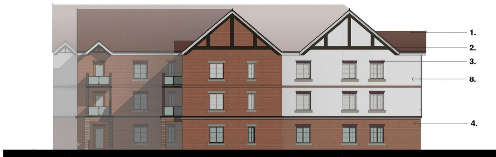
Block C - East Elevation 1 : 200

**All glazing above ground floor level on this elevation to be obscure glazed.**