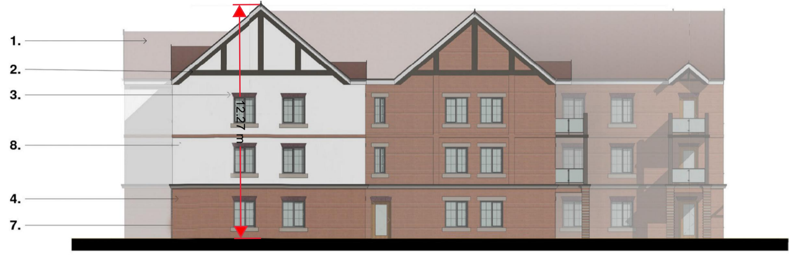
Block C - South Elevation 1 : 200