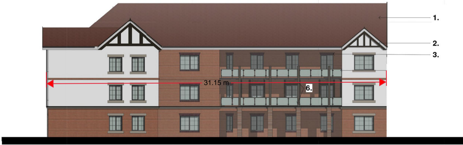
Block C - West Elevation 1 : 200

**All glazing above ground floor level on this elevation to be obscure glazed.**