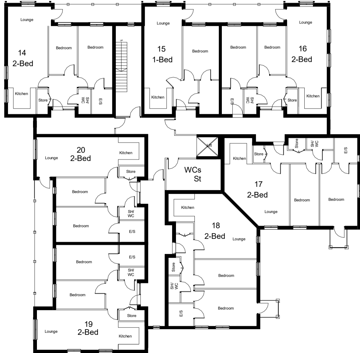
Proposed Second Floor Plan 1 : 200