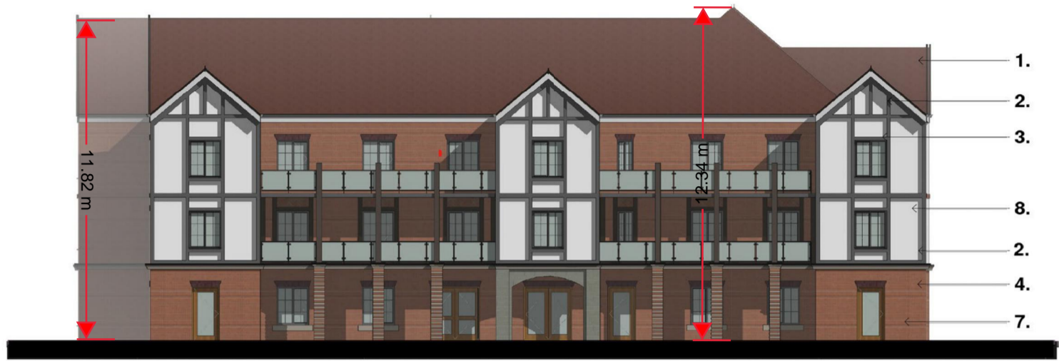
Block C - North Elevation 1 : 200